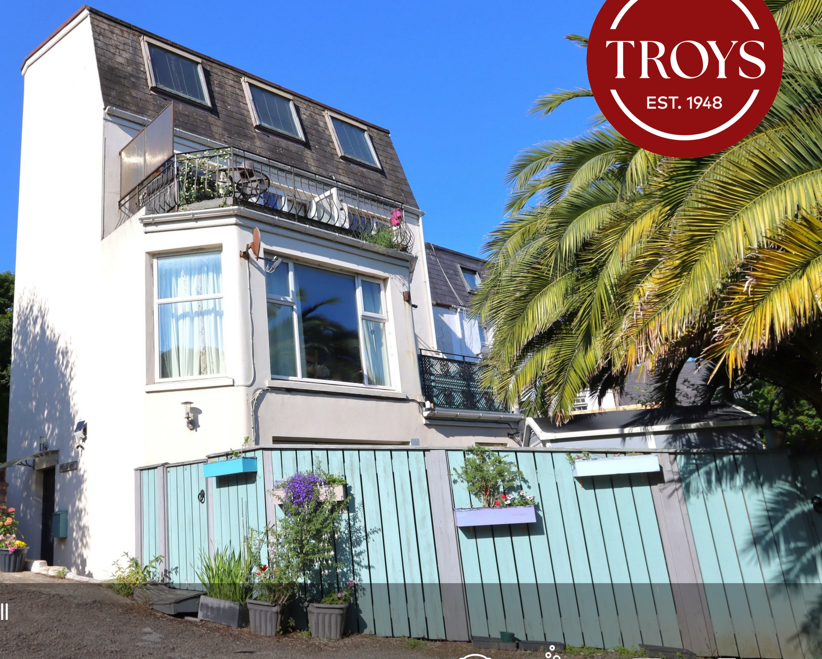
Melrose Apt Old Trinity Hill St. Helier, Jersey, JE2 4NG